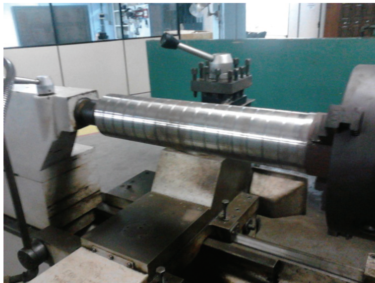
Figure 1. External cylindrical turning process.