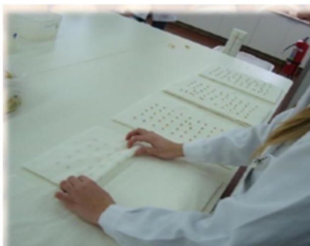
Figure 5. Seeds were packed in moist germination paper.

These seeds were packed in moist germination paper, as shown in Figure 5, and then held under these conditions for 16h at 25°C.