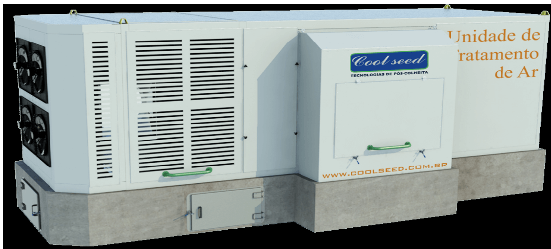
Figure 1. Air dehumidifier unit used (Image: Coolseed, 2015).

The air dehumidifier unit (model UTA 60) used in this study was developed by the Coolseed Company (Figure 1), installed in Santa Tereza do Oeste, Paraná State, Brazil.