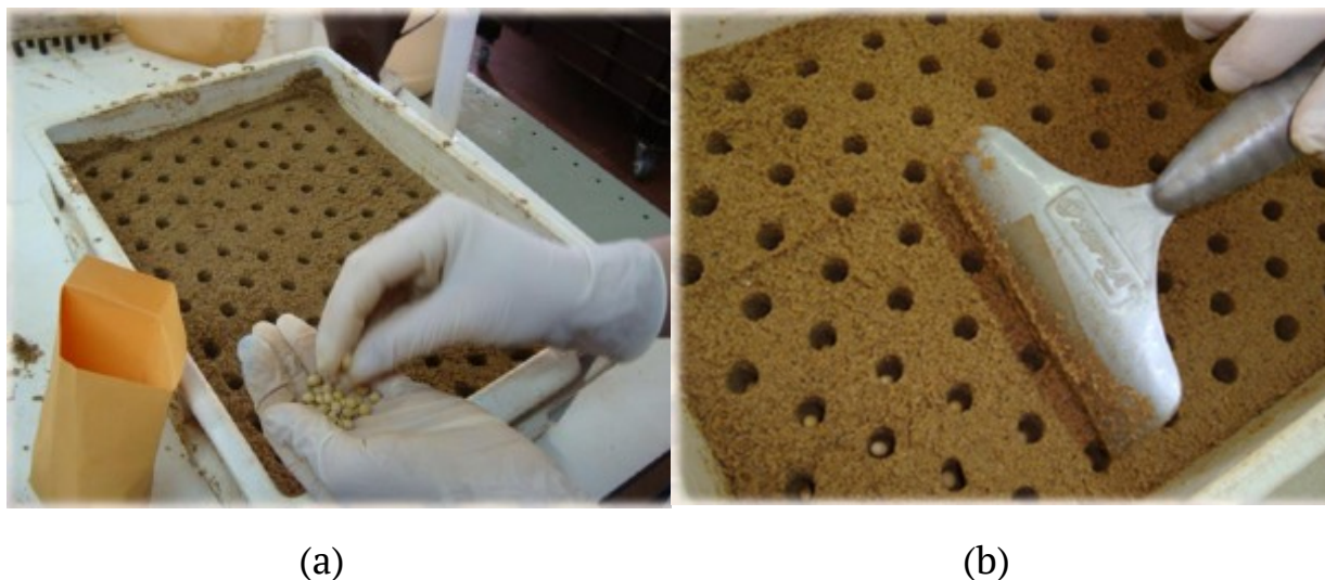
Figure 4. Emergence sand test (a) seed placement and (b) preparation of the carton.

In the emergence sand test, four replications of 50 seeds per treatment were seeded in plastic boxes, containing a substrate sand of medium texture, moistened and rinsed (when necessary) with water, as shown in Figure 4. The boxes were kept under laboratory conditions at room temperature for eight days, and then the seedlings were counted (Brasil, 2009).