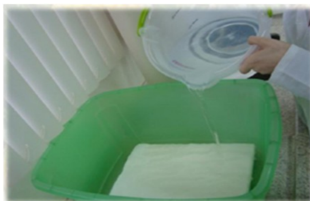
Figure 3. Germitest® paper moistened with water in a ratio of 1:2.5.

In the germination test, four replicates of 50 seeds of each treatment were used. They were seeded on Germitest® paper previously moistened with water in a proportion 2.5 times larger than the dry substrate mass (Figure 3).