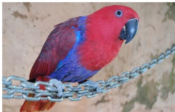
Figure 2. Female parrot eclectus ( Eclectus roratus ).