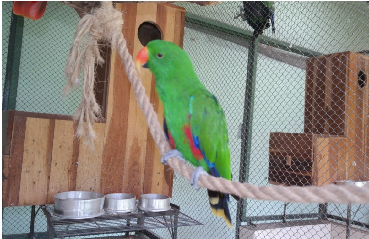
Figure 3. Enclosure structure.