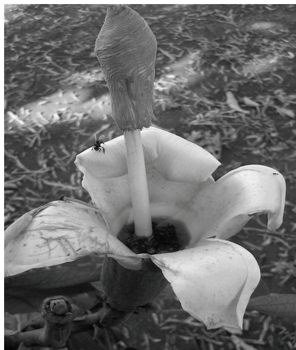
Figure 1. Flower of Ochroma lagopus Sw. with dead insects in the nectar.

No insect was found dead in the nectar of 20% of the flowers. Nevertheless, the average mortality was 23.7 insects per flower, and it is important to stress that 112 individuals were found dead in one flower, 63 of which belonging to the Partamona genus and 40 of the Trigona genus. It is possible that these Hymenoptera bees are more attracted to the nectar of balsa wood, which allows us to suggest that mortality is caused by some toxic element present in the nectar, or by asphyxia due to drowning in nectar (Figure 1), this latter cause is the most plausible due to the amount of nectar produced by O. lagopus flowers.