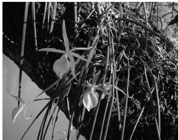
Figure 1. Brassavola cebolleta Rchb. f. in the study environment in Dourados, Mato Grosso do Sul State, Brazil.

Brassavola cebolleta is an annual species (NEWSTROM et al., 1994), similarly to most of the Orchidaceae (DAMON; SALAS-ROBLERO, 2007). Its flowering period began in June and extends until September, with the flowering peak in mid August (visual impression). Flowers were condensed in racemes with 5 to 7 flowers, spread along a 5.5 \pm 3 cm long raquis (Figures 1 and 2). The flowers opening is sequential with two open flowers per day, whose stigmas are already receptive during resupination until withering, 10 to 15 days later. When pollination occurs, the flower parts immediately senesce and dry. Measurements of the flowers are found in Table 1.