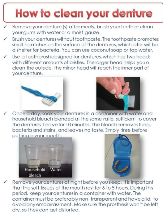
Figure 1. Illustrated leaflet.

The capable subjects were randomly divided into three groups. At the day of the installation of their new dentures, subjects of Group N / No guidance (n = 17) were advised to continue cleaning and wearing their dentures as they used to do. Group G / Guidance (n = 15) received an illustrated leaflet (Figure 1) and complementary verbal instructions about wearing habits and hygiene care of complete dentures. Subjects of Group GK/ Guidance + Hygiene Kit (n = 16) received the same leaflet and instructions of group G and also received a hygiene kit containing a recipient for immersion of dentures, recipient for storing the sodium hypochlorite solution and a denture brush.