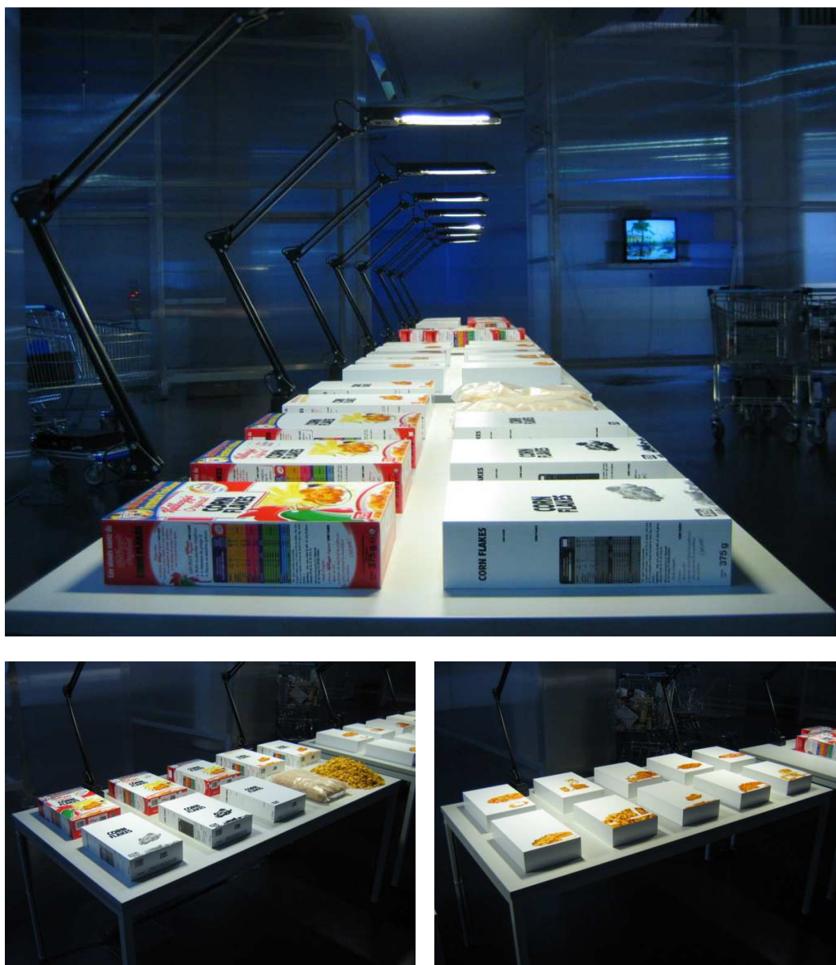
Fig. 3. Making things public: logotomies © Alexis Bertrand

which may be traced in several places such as the screens of financial markets, the computer code of a voting machine, and so on. Our installation focused on shopping carts and packaging as distributed, mundane, and unknown parliaments (Cochoy and Grandclément, 2005). In the latter case, we submitted the iconic Kellogg corn flakes package, with its famous green and red roaster, to a set of special destructive but also creative operations. Two of these operations were trying to take Naomi Klein (2000)'s call for a "no logo" economy seriously, by applying it to our colorful branded cereal boxes, in order to see what it does and where it leads (both physically and cognitively). In other words, we practiced two distinct types of "logotomies."